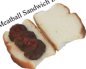
Meatball Sandwich Dry

Chicken Cutlet DOES NOT come with a side of pasta