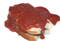
Meatball Sandwich Wet