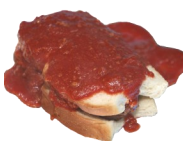
Sausage Sandwich Wet